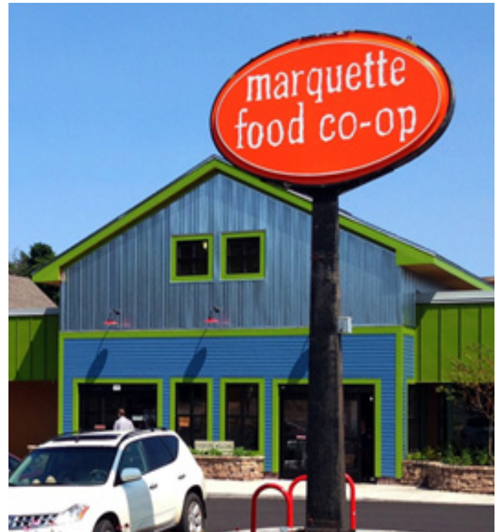
The Marquette Food Co-op.

A strong theme that emerged from Marquette County's story is that of the importance of personal interest and passion and the significant impact that a few individuals can have on local policy and project outcomes. The local food advocacy of the outreach staff at the Marquette Food Co-op has made great strides in educating residents and building interest in local food