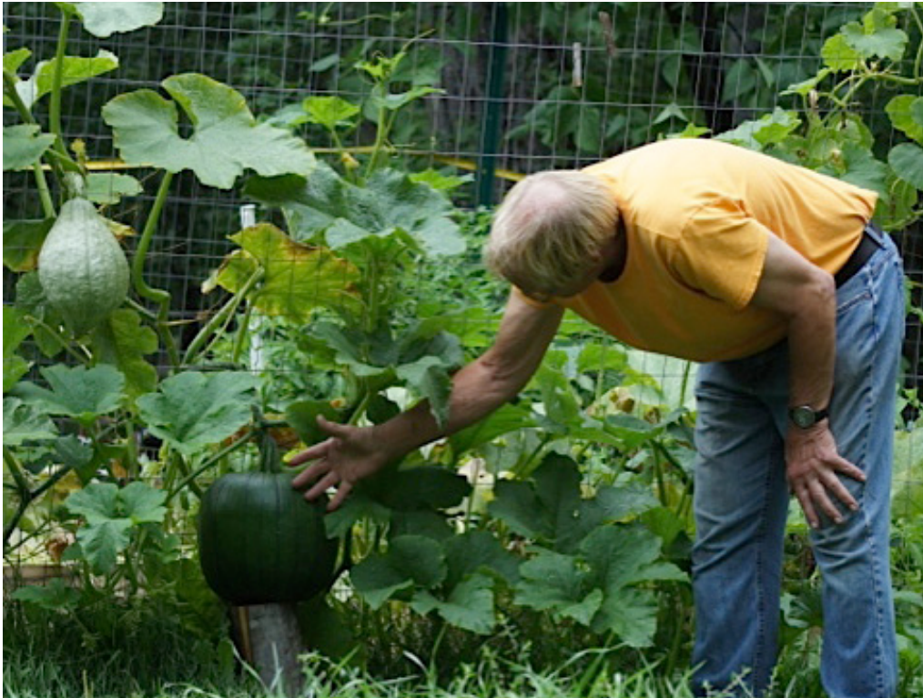
White Bear Garden.

The Marquette County Local Food Supply Plan and the food systems components of Chocolay Township’s master plan have been held up by local stakeholders as main factors of success in raising awareness of and local activity around food systems planning and policy development, among both local governments and other counties within the state. 35 According to Natasha Lantz of the Marquette Food Co-op, the county plan has “paved the way for all the rest of this food work. . . Just the fact that the county has a local food supply chapter of their comprehensive plan. . . gives you that support that you need and adds legitimacy.” 36